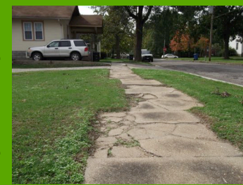
Example: Score 2

Any sidewalk that was missing or graded as a 1, 2, or 3 was added to the project list, as the sidewalk will either need to be built, rebuilt, or repaired in order to make safe and accessible pedestrian ways.