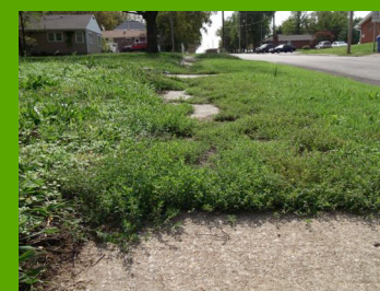
Example: Score 1

There was a thorough examination and inventory of sidewalk in Uniontown as part of the planning process. Every property lot along the route had its associated sidewalk graded on a scale of 1 to 5. The scores and an example are shown on the right.