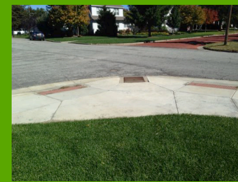
Example: Score 5

Score 3: Usable but non-ADA compliant. Likely could be repaired without total replacement.