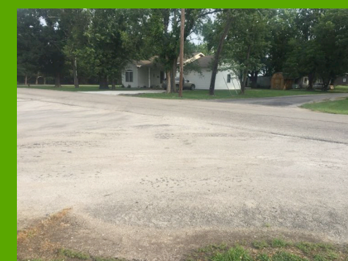
5th and Washington intersection, taken from the southeast corner

These warning signs and lights have been found to increase motorist compliance to crosswalks from 18% to 88%.