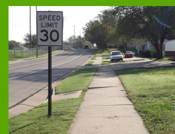
Example: Score 3

Score 1: Non-functional: Sidewalk exists but is broken and non-functional. Needs total replacement.