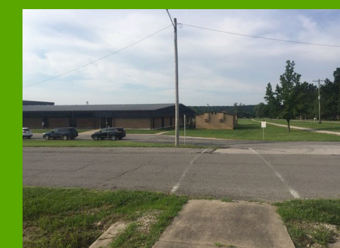
5th St facing the West Bourbon Elementary School driveway where sidewalk is recommended.

While sidewalk may seem simple, the details make all the difference between a good facility and an expensive mistake.