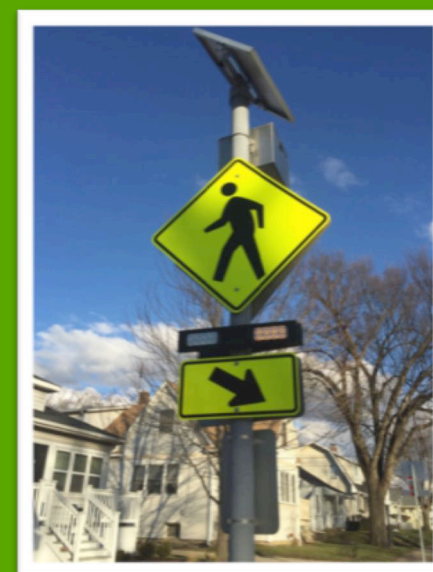
A rectangular rapid flashing beacon (RRFB)

Score 5: Good condition and ADA-compliant. No repairs needed.